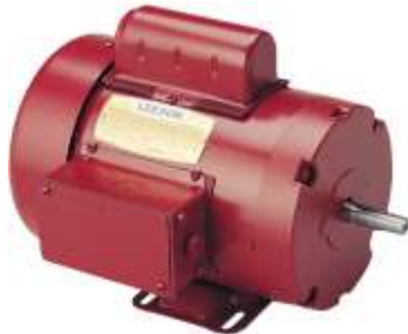
LEESON Farm Duty