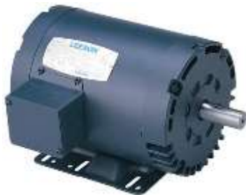
LEESON General Purpose