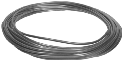
Sold By The Coil