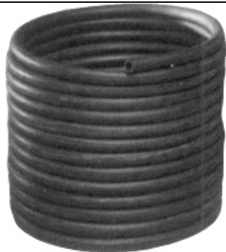
Sold By The Carton or Reel