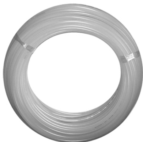
Sold By The Roll