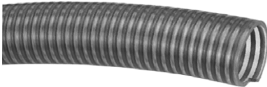
Sold By The Foot