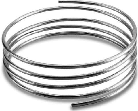
Sold By The Coil