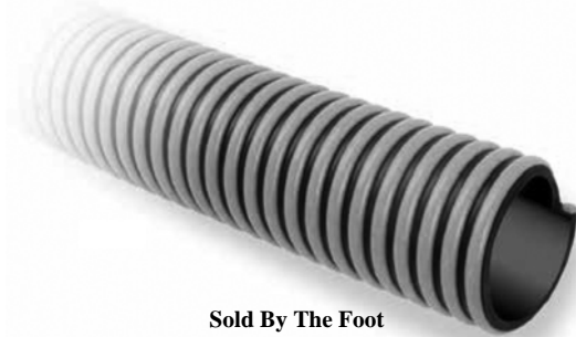
Sold By The Foot