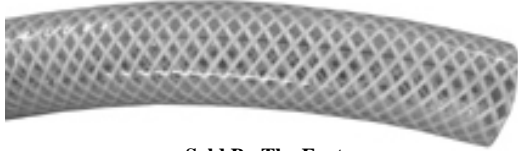
Sold By The Foot