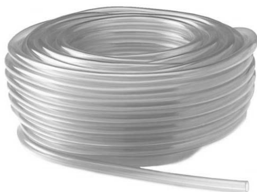
Sold By The Roll