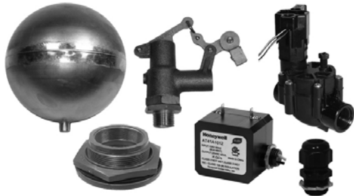
Not all package contents are pictured