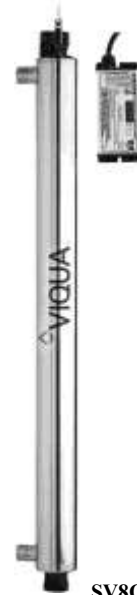
S8Q-PA, SV8Q-PA & VP950