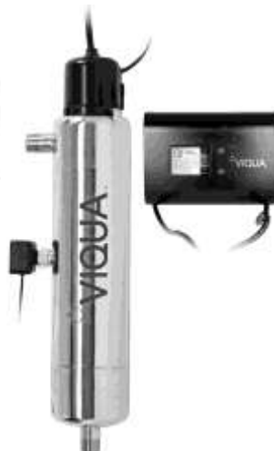
D4+, D4-V+, E4+ & E4-V+