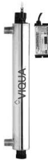
S5Q-PA, SV5Q-PA & VP600