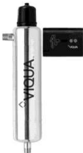
D4 & D4-V