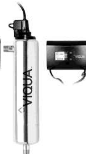
D4 Premium, E4 & E4-V