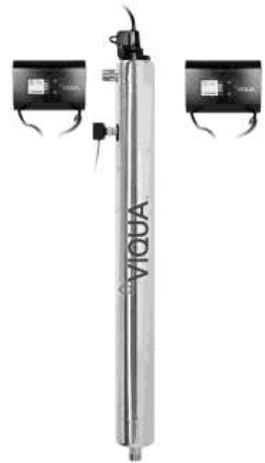
F4+ & F4-V+