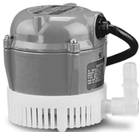
500286 & 501086

** Not recommended for aquariums, swimming pools and fuel oil transfer