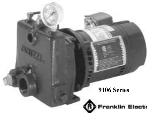
9106 Series Franklin Electric