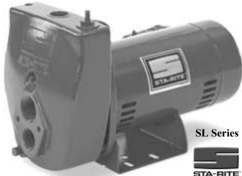
SL Series STA-RITE