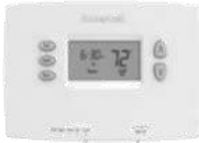
TH2110DH1000 & TH2110DH1002