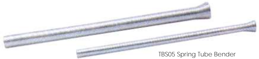
TBS05 Spring Tube Bender