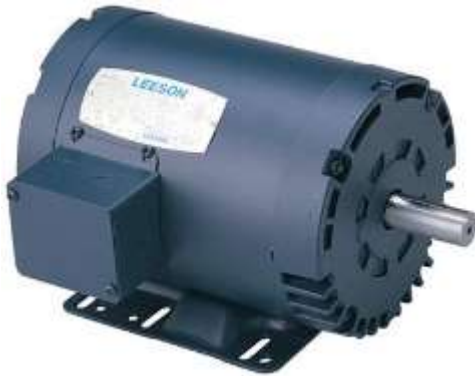
LEESON General Purpose