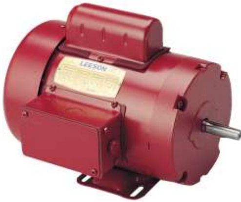
LEESON Farm Duty